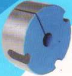
Taper Lock Bush