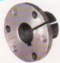
Flang Type Bush