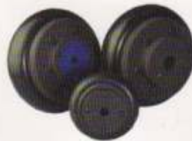
Flaxibale Tyre Coupling