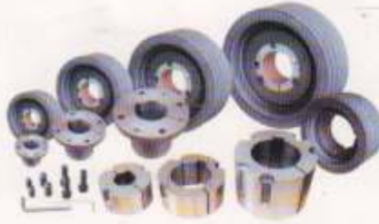
Taper Lock Pulley