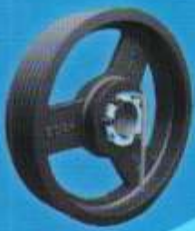
Taper Lock Pulley