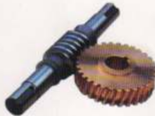
Worm & Worm Wheel