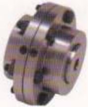
Flexibale Gear Coupling