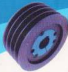
Solid Taper Lock Pulley