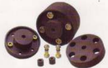
Bush Type Flaxibale Coupling