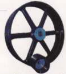
Big Type Taper Lock Pulley