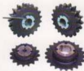
sprocket & Chain Wheel